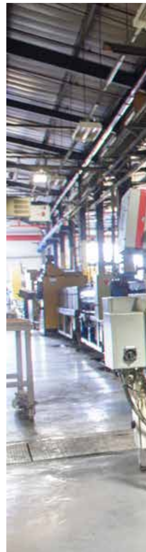
abb.com/drives/segments/plastics-and-rubber abb.com/motors-generators abb.com/drives

— For more information, please contact your local ABB representative or visit